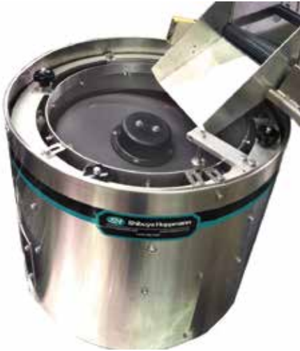
*Shown with optional prefeeder