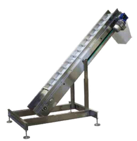
*Shown with optional stand, motor and custom chute.